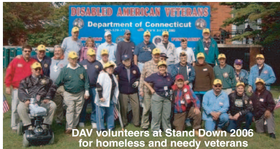
DAV volunteers at Stand Down 2006 for homeless and needy veterans