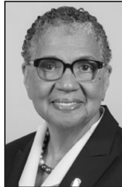
Delphine Metcalf-Foster DAV National Commander

Delphine Metcalf-Foster, a disabled U.S. Army veteran, was elected National Commander of the nearly 1.3 million-member DAV at the organization's 2017 National Convention in New Orleans, Louisiana.