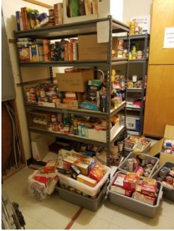
Our Pantry after Zach's Food Drive