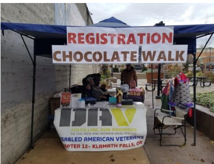
Our Registration Booth