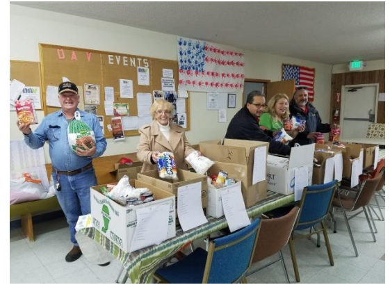
Some of the Veterans that received Food Boxes (we handed out 29 Thanksgiving Food Boxes)