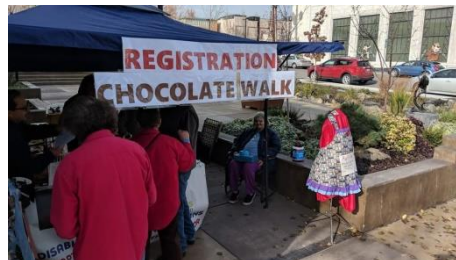
Walkers waiting to register

We had 27 businesses and 264 Chocolate Walkers participate which raised over $2,100 for our Chapter. If any chapter wants information on this event and how to have your own, please let me know. I'll be happy to share.