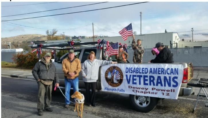
Getting ready for the Veterans Day Parade