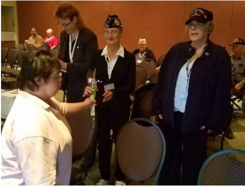
The Women Veterans that are moms receiving flowers for Mother's day.