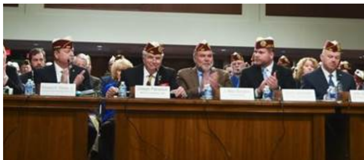
Above, L to R, DAV speakers noted with bullet

priorities for the 118th Congress and reports on our many programs and accomplishments. So today, I'm just going to highlight some of our more critical policy goals. I'd like to start off by introducing my DAV colleagues joining me here today.