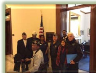
DAV and Auxiliary Members visit The office of Senator Ted Cruz