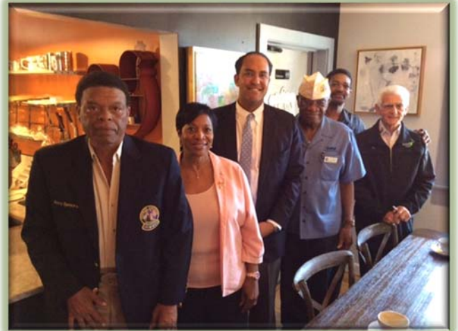
Meeting with Congressman Will Hurd